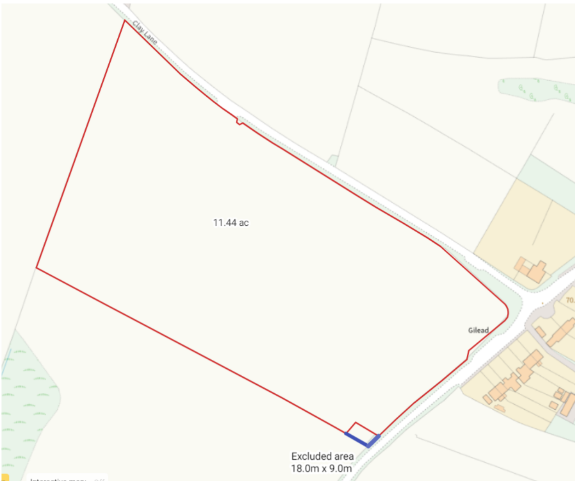
For identification purposes. Not to scale.